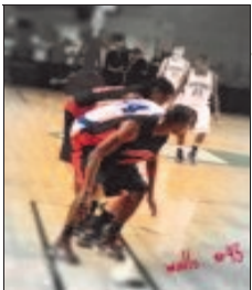
Dominating the Court - # 45