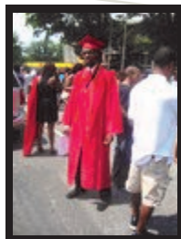
Graduating May 2011